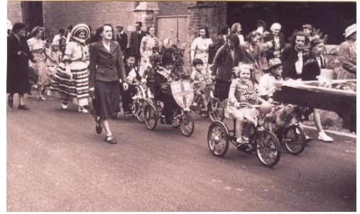
1950s (?) Parade along King Street, West Deeping

We started the season of talks in September with a topic to pay tribute to the Queen's Platinum Jubilee – "Village Celebrations", using our own archives